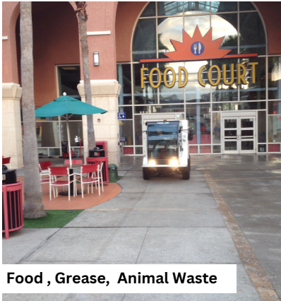
Food , Grease, Animal Waste